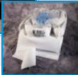
Order refill products to replace what you use.

Regulations that protect the environment effect those of you working in the logging industry. Fines from federal, state and local agencies can cost you a bundle.