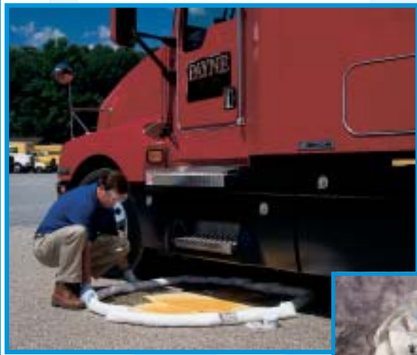
Breg's Spill Kit in action - stop the leak, contain the spill and soak up the fluids. Quick and easy.

Inexpensive response - specially designed for the logging industry